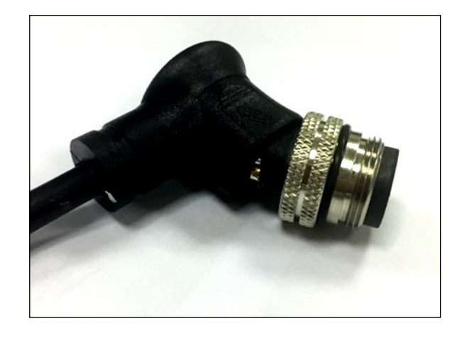
Fig 2.) Subsequent damage caused by improper use.

Also please do not attempt to lift or carry the battery via a connecting charging lead / plug as this can have the same effect & damage the equipment.